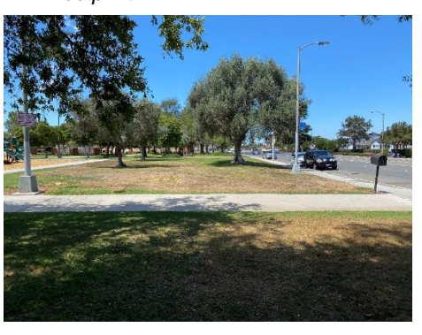
Photo 5. Alondra Park (looking west) along Manhattan Beach Boulevard.