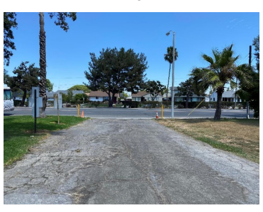
Photo 2. Manhattan Beach Boulevard parking lot entrance/exit driveway (facing north).

A 12-foot-wide multi-function access road would be constructed beginning at the existing maintenance yard on the eastern side of the Project site (south end of Manhattan Beach Boulevard parking lot) and running southerly to the property boundary, then westerly towards the Alondra Park Drain diversion point providing access to the Alondra Park drain manhole (see Photo 3) and the Alondra Park Drain diversion pipe and pretreatment devices. This access road may be constructed from permeable materials such as Invisible Structures product (or equivalent) or permeable pavement. Additional or replacement trees may be planted along this access road (with proper offset to playing fields).