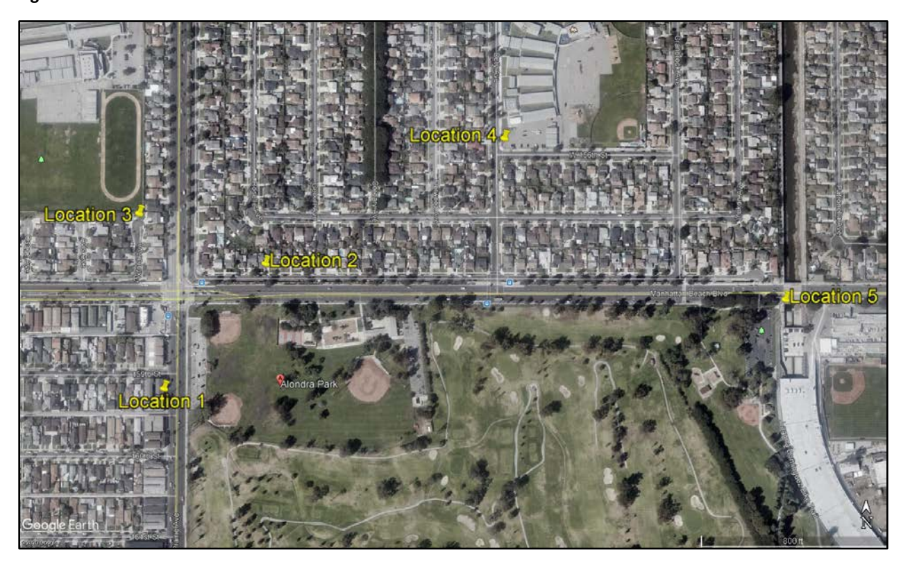
Table 3.10-1. Ambient Noise Levels Representative of the Project Area (dBA)