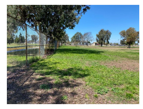
Photo 3. Southern boundary of Project site adjacent to the Alondra Golf Course (facing west).