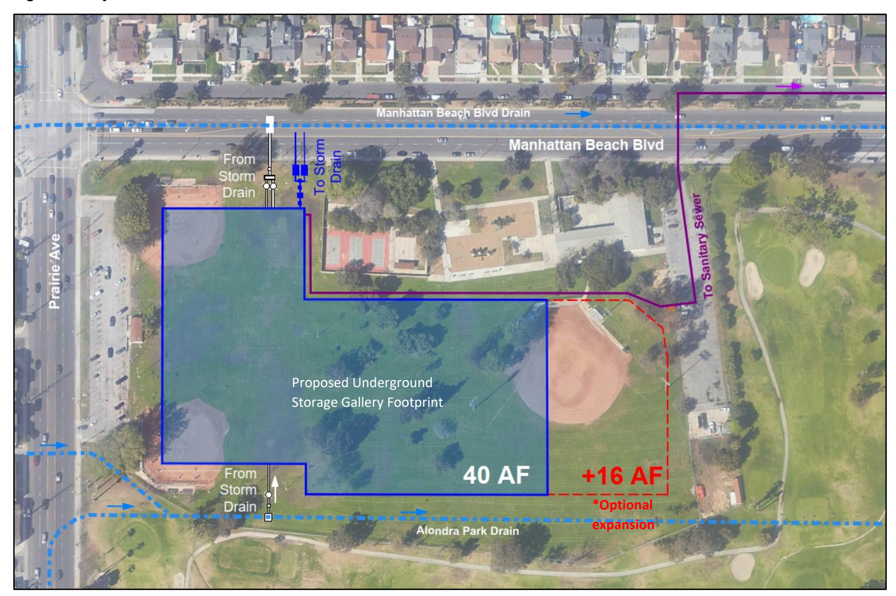
Figure 2. Project Site