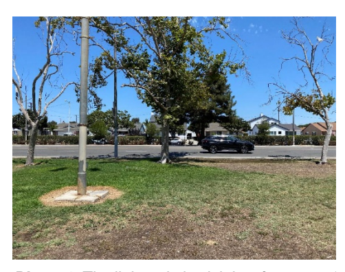
Photo 1. The light pole in vicinity of proposed maintenance loop driveway (facing north).