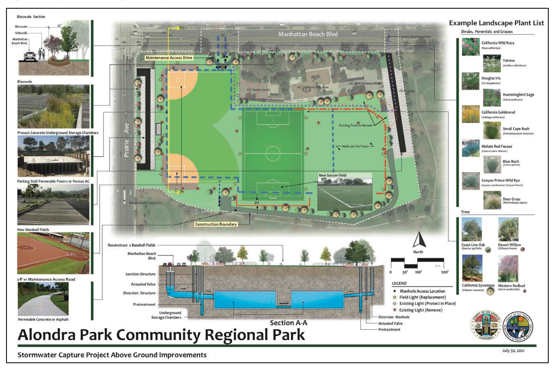
Figure 4. Proposed Aboveground Improvements