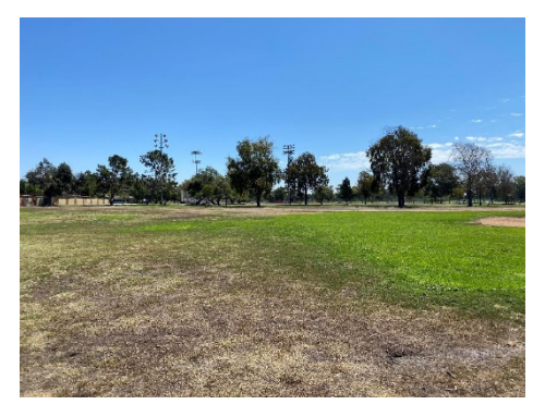
Photo 4. BMP footprint area (looking east); trees approximate the eastern edge of the BMP footprint.

The existing DPR maintenance yard south of the Manhattan Beach Boulevard parking lot and the existing multi-purpose building and DPR offices would remain protected in place and would not be affected by construction.